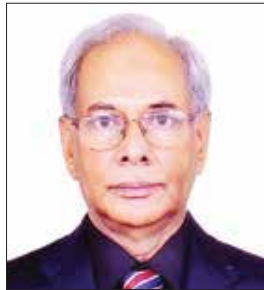
Muhammad Ali Jinnah