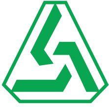
Bangladesh AOTS Alumni Society (BAAS)